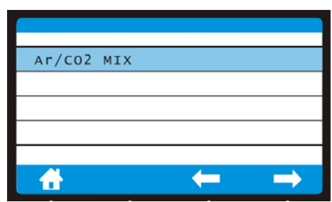
Step 3: Select your gas mixture