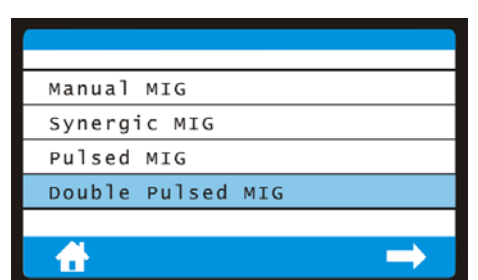
Step 1: Select your process