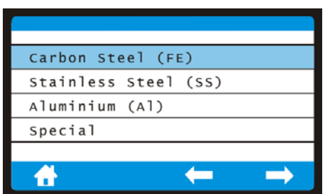
Step 2: Select your base material